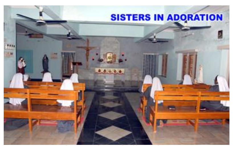
It is the privilege of all Bridgettines at the end of the Holy Mass continued in Eucharistic Adoration carried out through out the day.

APOSTALATE: Prayer and adoration- we give importance to liturgical prayers